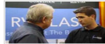
Custom Glass Solutions by Guardian RV Glass