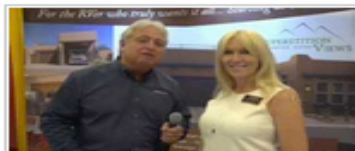
Cal-Am Motorhome Resort at Superstition Views