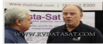
RV DataSat Satellite Antenna from Mobil...