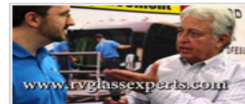
Laminated Glass Window Replacement with RV Glass...