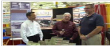
Summit Products Custom Motor Coach Upgrades