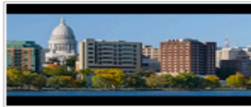
Road to Madison, Wisconsin, and the FMCA 2015...