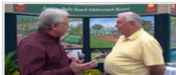
Jupiter-Palm Motorcoach Resort for Class A...