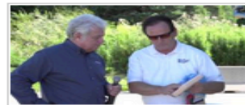
Wash Wax All Waterless RV Wash Products