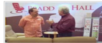
Bradd and Hall RV Furniture - Flexsteel and More