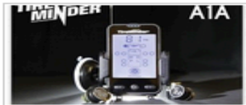
TireMinder A1A Tire Pressure Monitoring System...