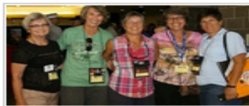
FMCA Madison 2015 Family Reunion and Motorhome...